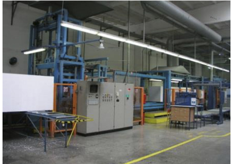
Fig. 10 - Board cutting