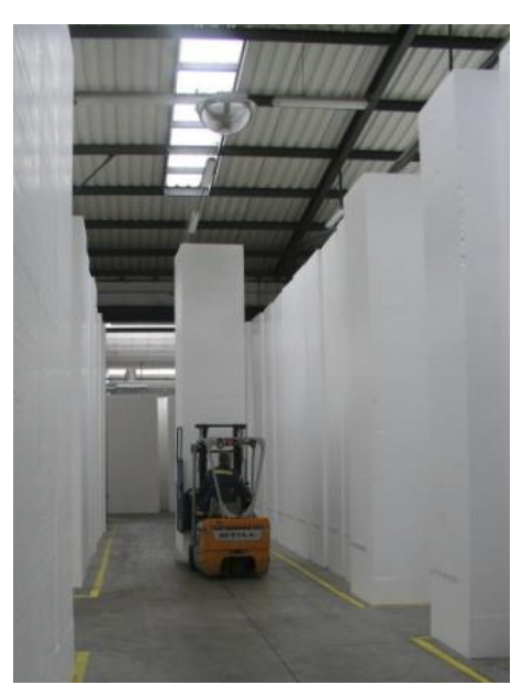
Fig. 9 - Block stabilization