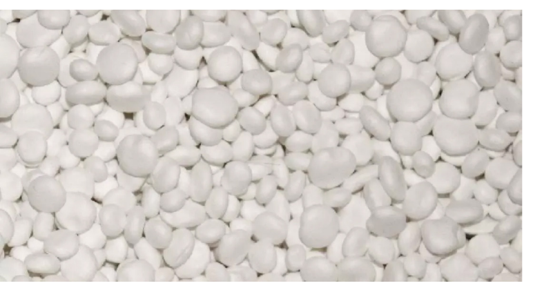
Fig. 13 - Raw material for the production of EPS

EPS waste material from the production process (e.g. offcuts from cutting blocks into boards) is returned through the recycling center back to the beginning of the production process and replaces part of the primary raw material. This waste is processed internally and does not leave the manufacturing plant. This process minimizes the amount of waste generated during the production of expanded polystyrene boards.