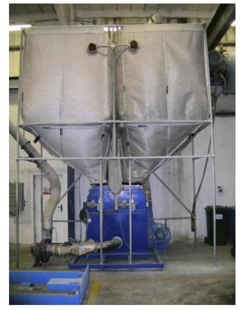
Fig. 7 – Adding recyclates