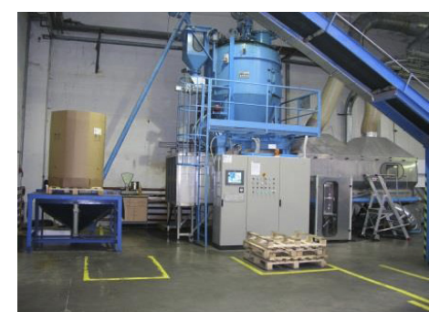
Fig. 5 - Pre-expansion