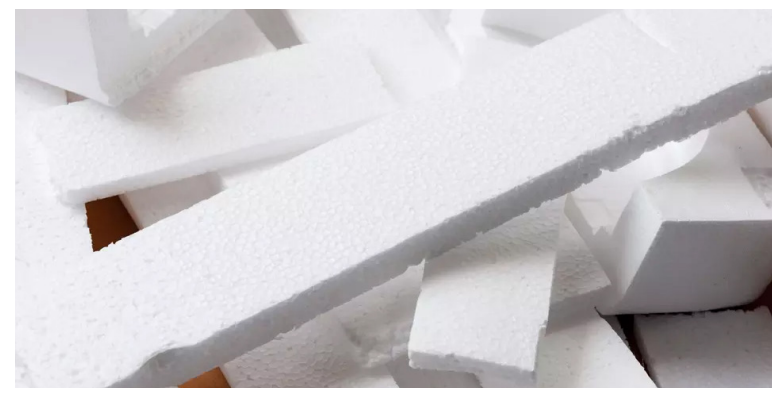
Fig. 14 - EPS offcuts from production

Only waste that meets the requirements set for input raw materials can be used for further processing (recycling). In practice, this means that for our further processing of the recycled material, it is important that the delivered recycled material is free of impurities, without any adhesives, paint residues, wood, plastic, paper labels, metal, food residues, sealants, adhesives, mortar, etc. it is necessary to be able to crush the delivered recyclate.