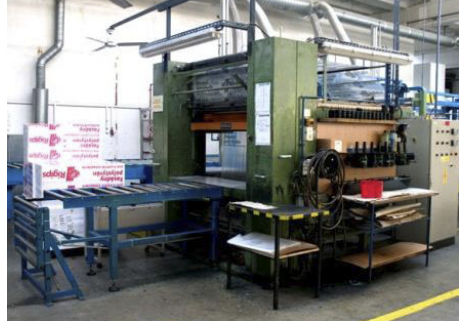
Fig. 12 - Packaging