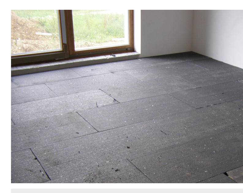
Fig. 1 - Example of Isover EPS Grey 100 application

Isover EPS Grey 100 is used as floor insulation or flat roof insulation. It is only cut during application.