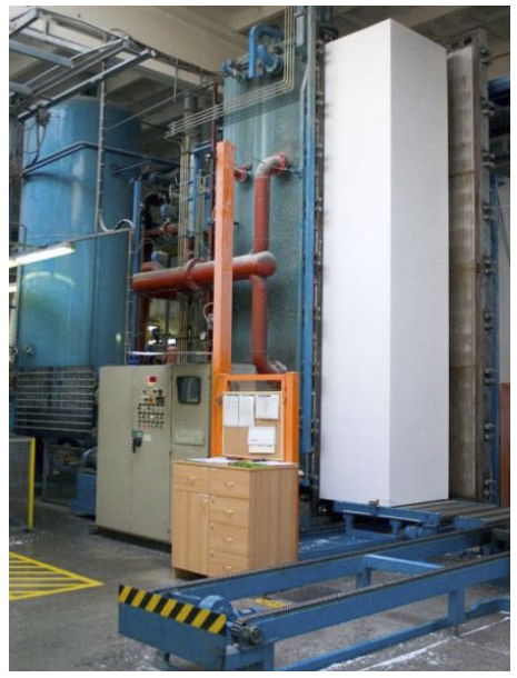
Fig. 8 - Block production