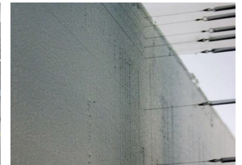
Fig. 11 - Cutting detail