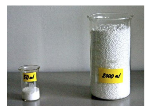
Fig. 4 - Primary raw material